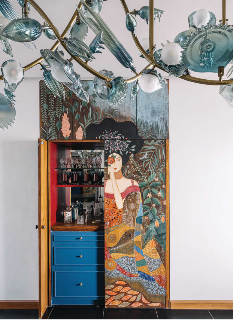
Behind captivating hand-drawn artwork by Rogan design, on veneer pocket doors is a hidden bar counter and storage solution. Ovehead a sculptural light fixture by klove Studio illuminates the space

A PIECE YOU COVET FROM THIS HOME? I’d possibly run away with the antique doors if I could. IF THE HOME WERE A CELEBRITY, WHO WOULD IT BE? Helen - the iconic Indian actress and dancer.