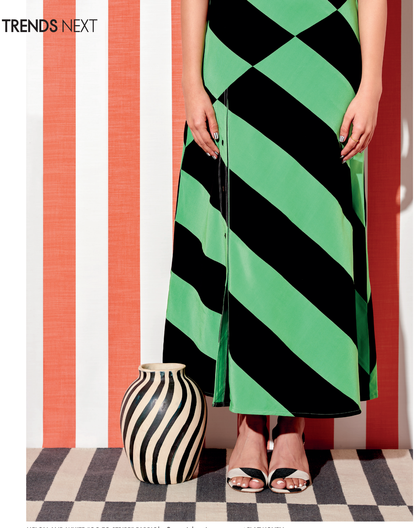
MELON AND WHITE "GO TO STRIPE" FABRIC by Perennials, price on request FLATWOVEN , STRIPED GREY "STOCKHOLM" RUG by IKEA, ₹14,990 CHEVRON VASE from Tablescape by Eeshaan Kashyap, ₹5500 GREEN "CHESS CROSS DRESS" by Lovebirds, ₹17,900