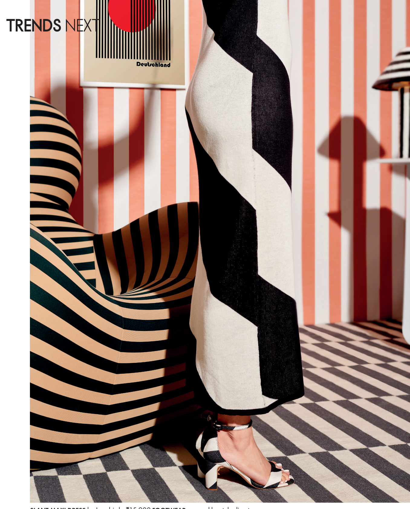
SLANT MAXI DRESS by Lovebirds, ₹15,900 FOOTWEAR sourced by style director FACING PAGE FROM LEFT BLACK "SUPERLOON" FLOOR LAMP designed by Jasper Morrison for Flos, available at AuxHome, price on request POWDER COATED "FRAME METAL BENCH" by The Metal Project, ₹22,100 GLOSS AND GOLD LUSTRE "LION MASK" BY LLADRŌ, ₹2,69,000 "BORA STRIPE" BAG by Chamar, ₹50,000 "TOCCO" SIDE TABLE by Wriver, price on request STRIPED BLACK AND WHITE CERAMIC VASE by Freedom Tree, ₹1,152 GLASS SHAPED STRIPED BLACK AND WHITE CERAMIC VASE by Freedom Tree, ₹880 DIAGONAL CUSHION COVER by Abaca, price on request