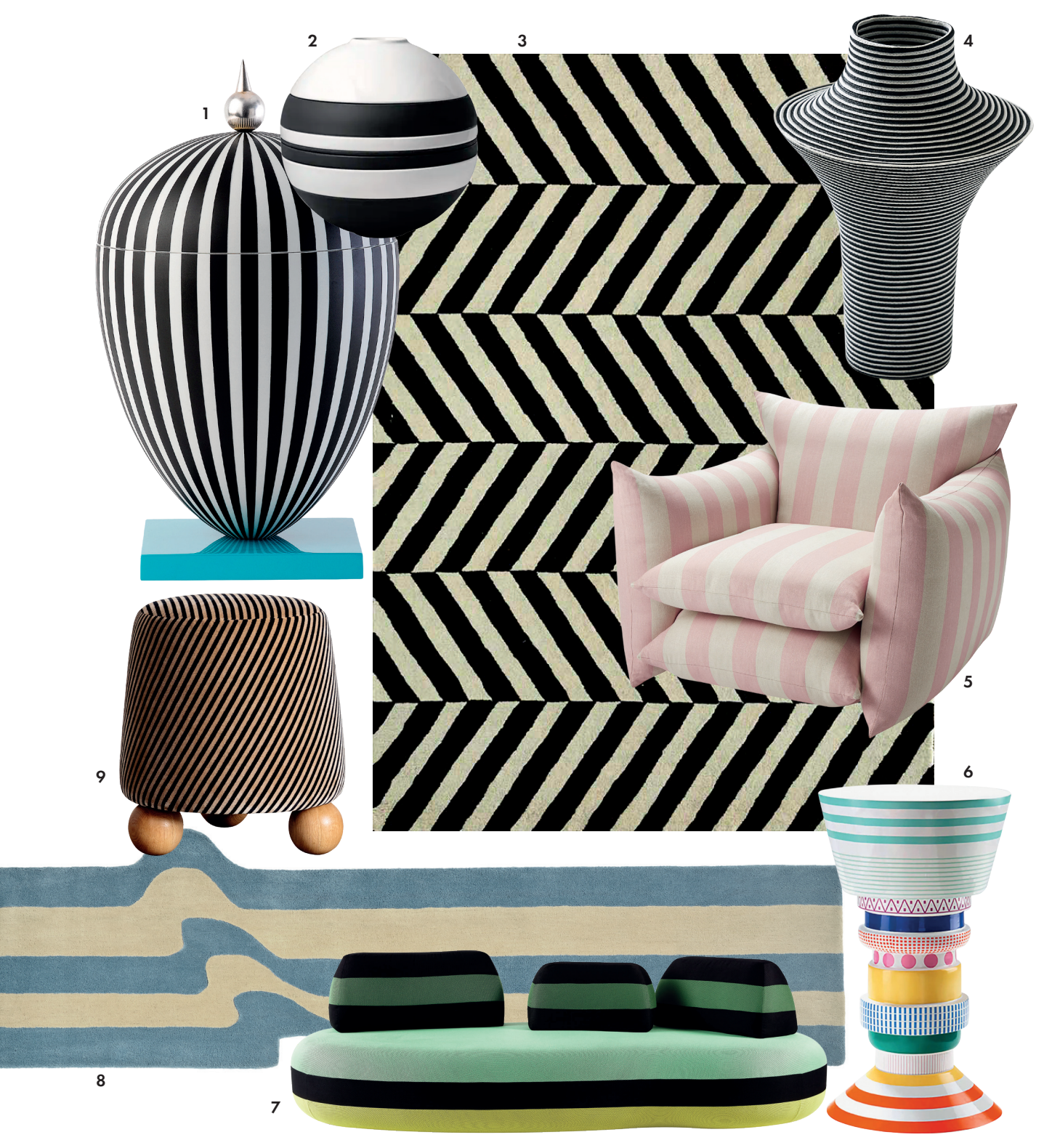
1. CERAMIC "WEDGWOOD" VASE ON BLUE RECTANGLE from Wedgwood designed by Lee Broom, price on request 2. PREMIUM PORCELAIN 7-PIECE TABLE CENTREPIECE "ICONIC LA BOULE BLACK & WHITE STARTER SET" from Villeroy & Boch, ₹36,000 3. HAND TUFTED WOOL EBONY AND SNOW WHITE "CASCADE" RUG from Jaipur Rugs, ₹475 per sq ft 4. BLACK AND WHITE VASE, part of the Stripe Stripe collection from Mobje, available at Dialogues by Nirmals 5. BEECH, BIRCH AND BIRCH PLY SPRUNG BASE "ROSE" STUDIO CHAIR from Buchanan Studio 6. CERAMIC "GILBERTO" SIDE TABLE designed by Pepa Reverter, part of the Bossanova collection from Bosa, available at Sources Unlimited 7. UPHOLSTERED IN STRETCH FABRIC "BOMBOM 277" designed by Joana Vasconcelos for Roche-Bobois 8. 100% NEW ZEALAND WOOL "SALERNO RUNNER - AZZURRO" designed by Home Union in collaboration with Pieces Collection 9. NATURAL OAK OBLIQUE PATTERNED BEIGE NOIR "MORRO" OTTOMAN by Kelly Wearstler, all prices on request For details, see Address Book